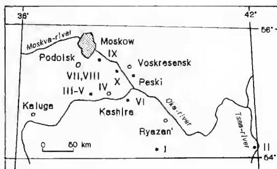
Fig. 1. — Location map of the stratotype sections (I-X) of the Moscovian Stage (for the list of the sections, see figures 2, 3).

Deposits of the Tsna Subformation correspond to the Zone Aljutovella priscoidea , Hemifusulina volgensis . This typical foraminiferal assemblage, characterized by a high degree of similarity in all regions where these deposits are represented (the Russian Platform, the Donets Basin, the Cisuralian Depression, Urals, Tien-Shan, etc.), includes the following species: Schubertella gracilis znensis , Sch. galinae , Ozawainella digitalis , Profusulinella prisca timanica , P. nuratovensis , P. juata , Taitzeboella protibroviichi , T. pseudolibrovichi , Aljutovella parasaratovica , A. saratovica , A. priscoidea , A. znensis , Hemifusulina dutkevichi , H. volgensis .